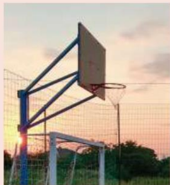
Half Basketball Court Soar High