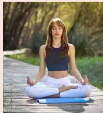
Yoga/ Meditation Corner Nourish your body Mind and soul