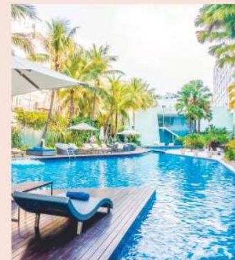
Half Olympic Size Infinity Swimming Pool Make every lap count