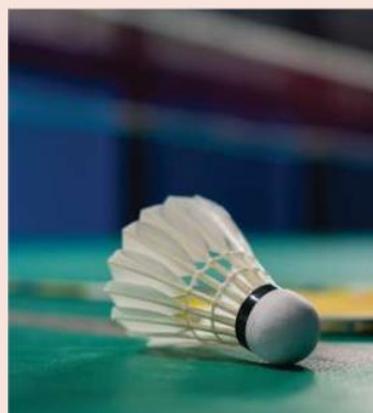
Badminton Court Smash All Hurdles