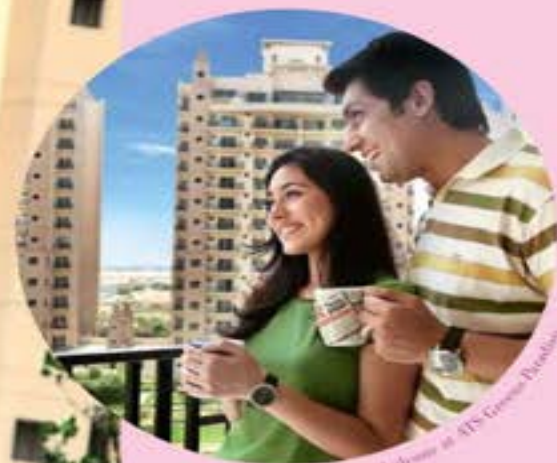
A spacious balcony at ATS Greens Paradise