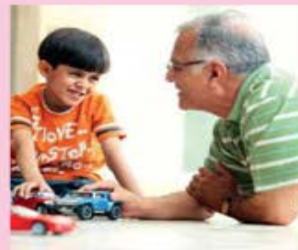
Auto Show at ATS Greens II