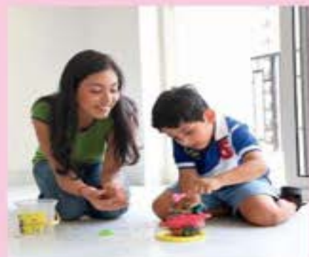
A typical floor at ATS Greens II

Top class construction quality is a hallmark of all ATS projects. The best materials and workmanship deliver quality you can literally touch with your fingers. And when you combine that with a well-designed interior, the result is a home to be proud of. 🌿