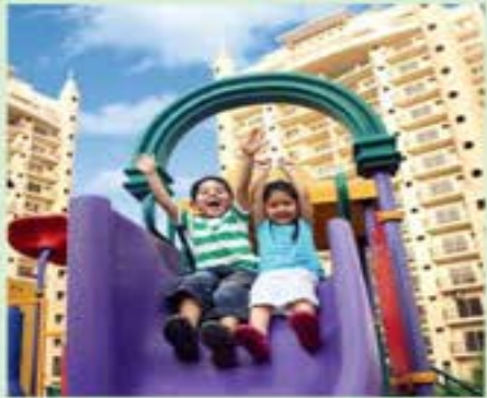
A children's play area at ATS Greens Paradise

At ATS, the layout of the site receives a lot of attention. Maximisation and even distribution of the green areas, the way the towers are arranged, the provision of large community areas like the clubhouse and the swimming pool – all these are vital ingredients of the joy of living at an ATS development. 🌿