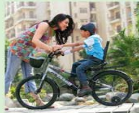
Traffic jam at ATS Village