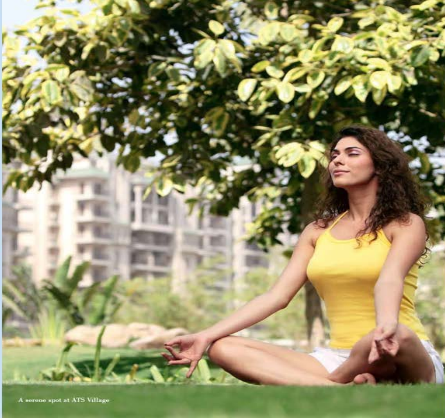
A serene spot at ATS Village