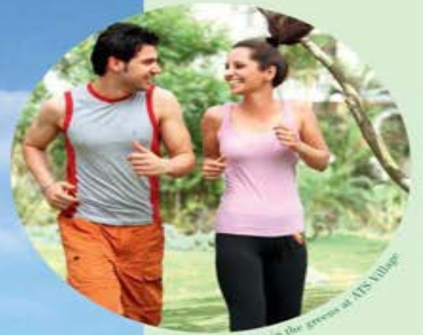
Jogging in the greens at ATS Village