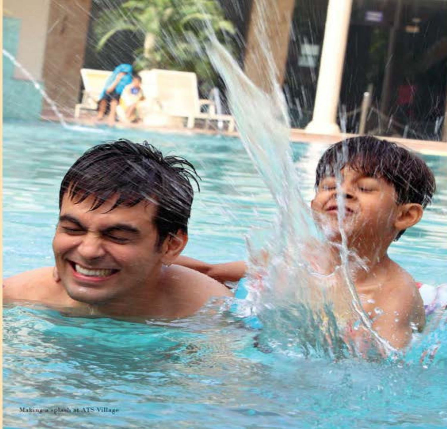
Making a splash at ATS Village