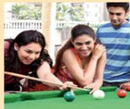
ATS Village has a full-size snooker table