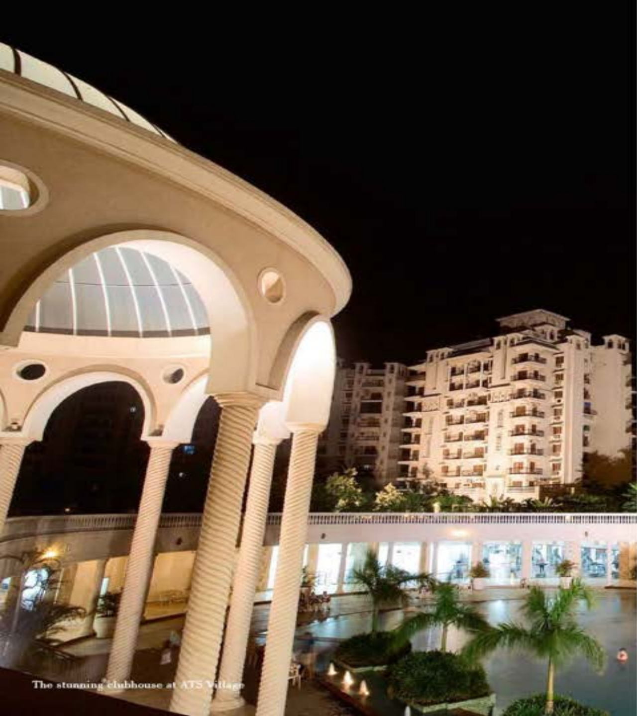
The stunning clubhouse at ATS Village