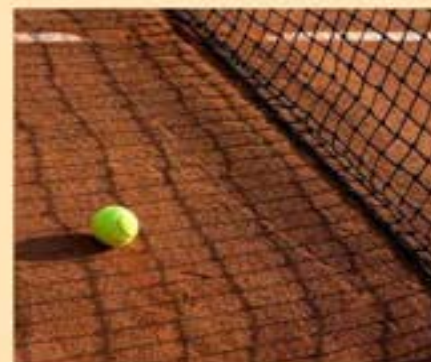
ATS Greens Paradiso: Game, set and match