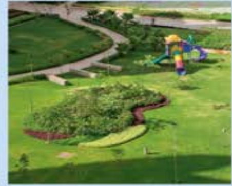
Acres of greenery at ATS Greens Paradise