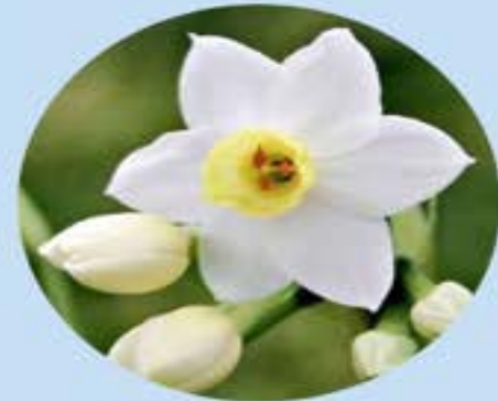
Nature in full bloom at ATS Village