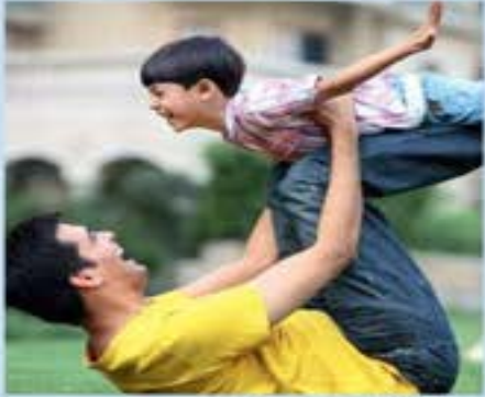
Energy flows at ATS Village

A feeling of largeness and green open spaces is a distinctive element of ATS properties. There are beautifully maintained parks, flower-bordered walkways, and patches of green tucked away in unexpected places between towers. Stepping out onto dew-covered grass in an aesthetic and invigorating environment becomes a daily pleasure for ATS residents. 🌿