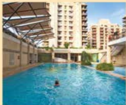
A refreshing swim at ATS Greens II

Large and luxuriously fitted clubhouses are probably the best-known feature of ATS developments. Tennis, squash and basketball courts, shopping arcades, gymnasiums, spas, high tech security and ample parking are just some of the other amenities ATS offers its residents. 🏡