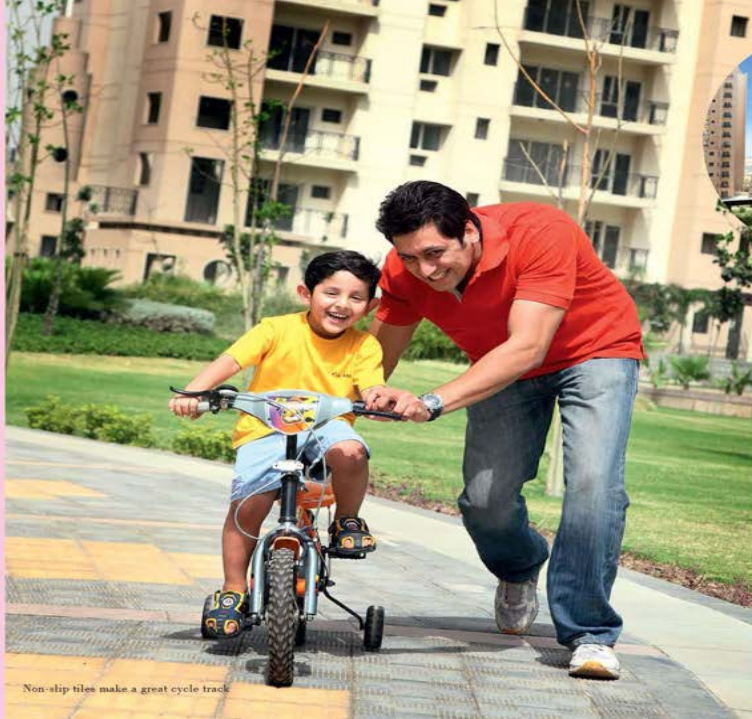
Non-slip tiles make a great cycle track