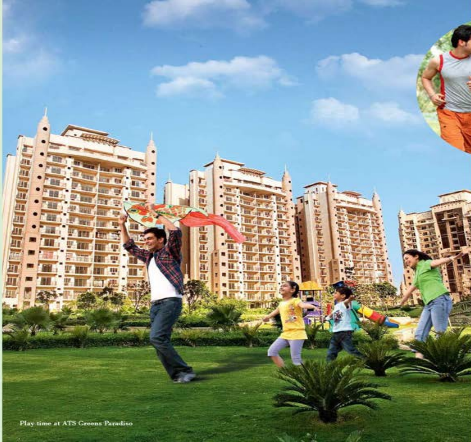
Play time at ATS Greens Paradise