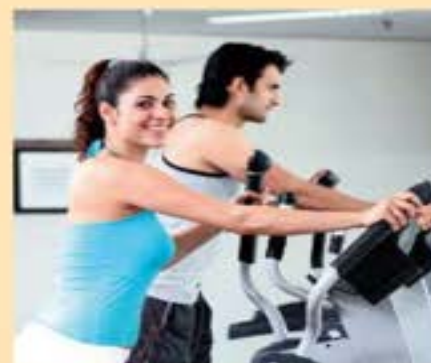
A state-of-the-art workout at ATS Village